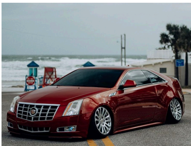
CUSTOMER RIDE: IG @STATILAC