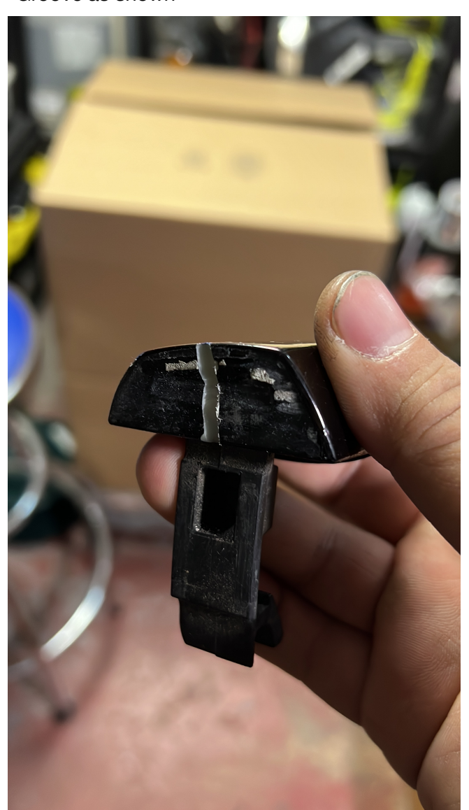
Groove as shown